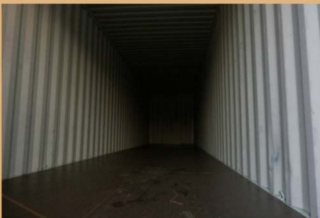
Flooring for sea containers