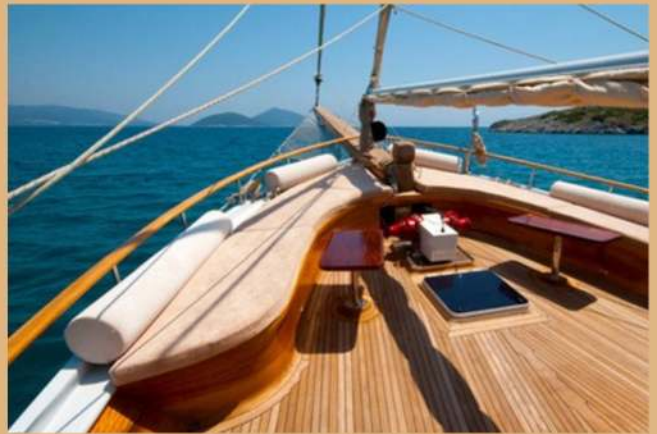
Flooring for boats and yachts