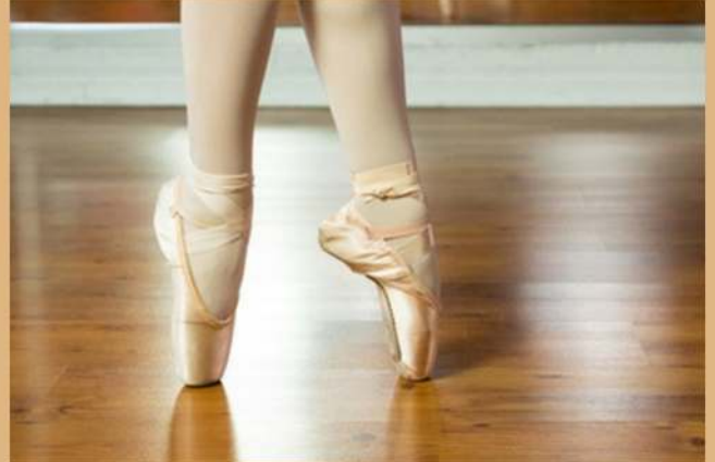
Stage floors and sets