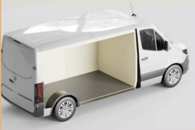
Flooring for light commercial vehicles