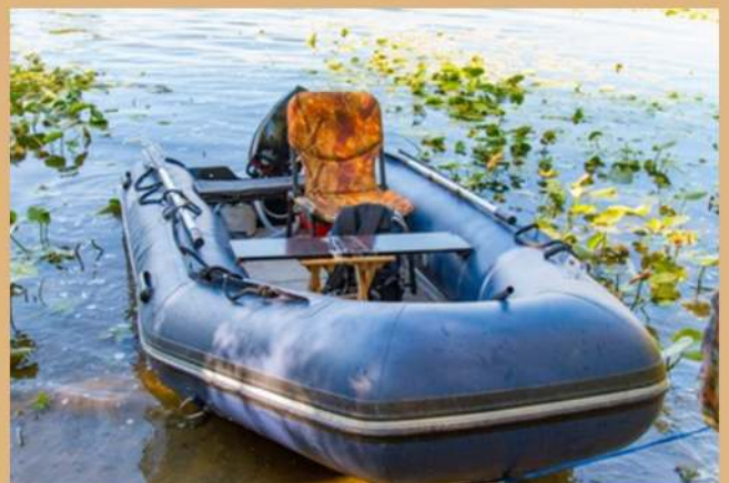
Flooring for small vessels